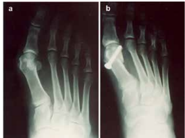
Figure 3. Anteroposterior radiograph in the standing position of a patient with hallux valgus deformity before (a) and after (b) the Wilson's osteotomy.

HVA decreased significantly from preoperative 26.6^\circ \pm 6.8^\circ to 7.3^\circ \pm 0.1^\circ at three weeks after the operation ( p < 0.001 ). IMA also showed significant decrease with osteotomy (from 12.7^\circ \pm 2.2^\circ to 6.4^\circ \pm 2.4^\circ , p < 0.001 ) (Figure 3). The decrease in both HVA and IMA was persistent to last evaluation (Table 2).