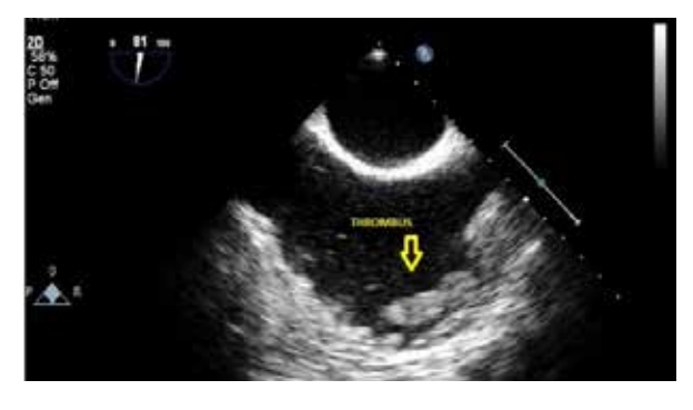
Figure 2: TEE revealed right atrial SEC with the presence of thrombus approximately 1.5x4.0 cm in size originated from right atrial appendage.