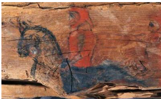
Image 8. Painted Figure on Original Wood

The artifacts, which were found during illegal excavations in the Tatarian Tumulus in the Dinar district of Afyonkarahisar in 1969 and some of which were smuggled abroad, were brought to Turkey. The painted friezes of the 2500-year-old wooden burial chamber were revealed with this exhibition. The stolen pieces were returned to the museum.