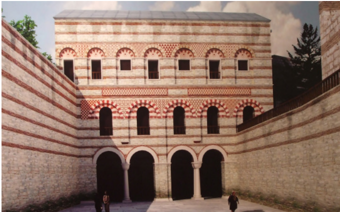
Tekfur (Porfirogennetos) Palace Animation

The 3-D reconstructions for the Exhibition of Byzantine Palaces in Istanbul were produced by A. Tayfun Öner (2008, p. 172)