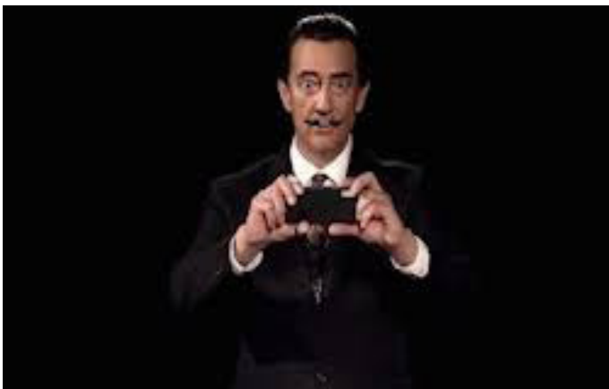
Image 11. Florida Salvador Dali Museum Digital Screen