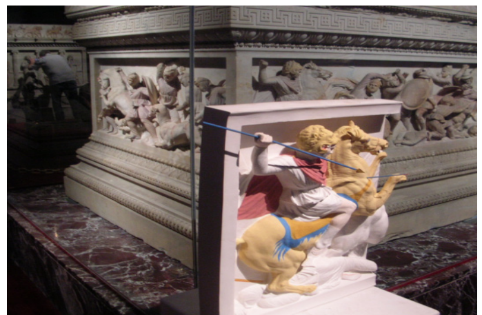
Image 3. Painted Sculpture in Exhibition of Gods in Colour in Archaeological Museum (Brinkmann, 2019, p.156)

Exhibitions held at the Istanbul Archaeological Museum and the Athens Archaeological Museum demonstrate that these sculptures were originally painted. The Alexander Sarcophagus, discovered in 1887, is a notable example exhibited in the Istanbul Archaeological Museum. The fact that these sculptures were painted was first proposed in 1920. Similarly, at the Acropolis of Athens, it was revealed in 1920 that the Augustus Prima Porta statue, known since 1863, was painted. Furthermore, painted decorative artworks were found earlier in the houses of Pompeii. While it is established that these artworks were painted, there is insufficient information about their original appearance due to the fading of their colours. The original versions of these statues are painted (Brinkmann, 2019)