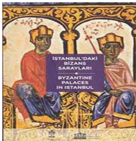
Image 1. Exhibition of Byzantine Palaces' Poster

In 2010, lost Byzantine palaces were reimagined and exhibited using computer technology. The Exhibition of Byzantine Palaces in Istanbul showcased these reconstructed palaces for the first time. Held at the Istanbul Archaeological Museum from June 21 to September 21, 2010, the exhibition featured a simulation of the ancient Byzantine town prepared by the Ministry of Culture and Tourism. Missing Byzantine palaces, along with their artifacts, were made accessible to the public. These palaces were among the largest and most renowned in Byzantine history, and their approximate locations were documented in historical texts. The exhibition included simulations and archaeological architectural photographs of Myrelaion, Bukoleon, Lausos, Antiokhos, Blakhernai, Big Palace and the Palace of Tekfur (Porfirogennetos).