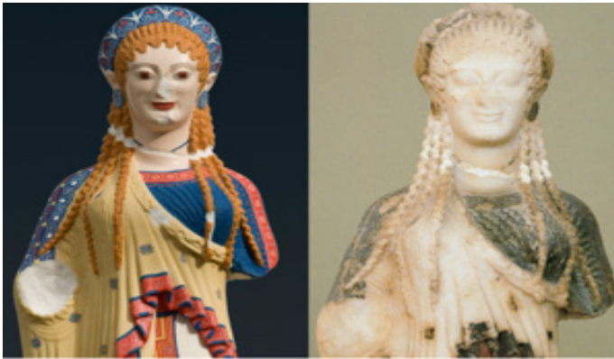
Image 5. Exhibition of Gods in Colour in Archaeological Museum

Importantly, these pigments were often traded across regions, highlighting their connection to trade routes and commerce.