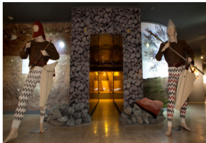
Image 9. Impersonation from Exhibition of Tatarian

The Tatarian Tumulus, Exhibition of Return of Colours holds significant importance for the Republic of Turkey. This exhibition, organized by the European Capital of Culture Agency and the Government of Germany, was sponsored by Yapı Kredi Vedat Nedim Tör Museum. The materials in the exhibition, through replicas, highlights the connections between the Tatars in Iran, Scythians, and Crimea. The wood from the Tatarian Tumulus provides insights into the flora of this region dating back to 531 BC.