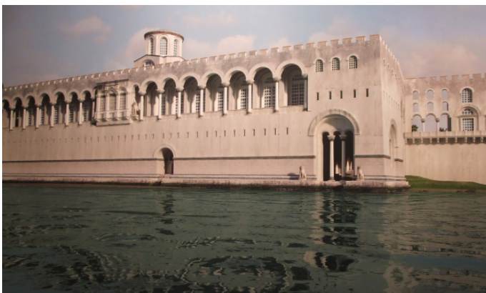
Boukoleon Palace Animation

Image 2. Tekfur(Porfirogennetos), Big, Boukoleon Palace Digital Exhibitions of Byzantine Missing Palaces from Exhibition