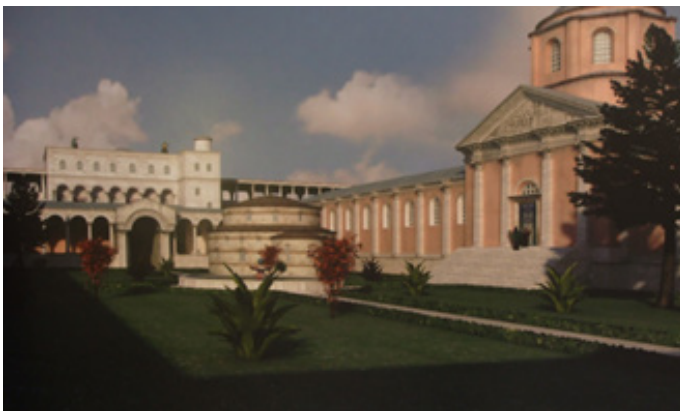
Big Palace Animation