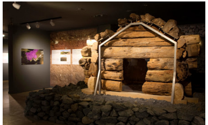
Image 6. Exhibition of Tatarian Mound, Yapı Kredi Vedat Nedim Tör Museum