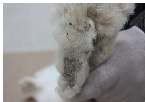
Image 4. Foot injury of the infected rabbit