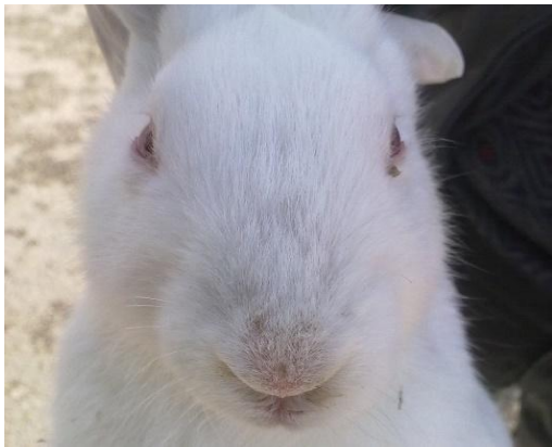
Image 5. View of the head region post-clinical improvement

Following the eprinomectin administration, clinical recovery of the rabbits started; no agent was detected in the skin scrapings derived on the 7 th and 14 th days (Image 5, Image 6).