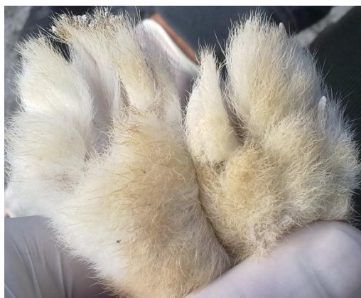
Image 6. View of the foot post-clinical improvement