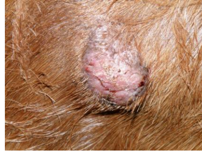
Figure 1. Over the right upper gluteal surface, close up picture of the lesion.

adnexal tumor). The tumor was surgically excised and fixed in 10% formalin for histopathological examination. Paraffin sections (4 µm thickness) were prepared properly and stained with Haematoxylin-Eosin (HE). In microscopic sections, enlargement of superficial opening of the hair follicle in tissue covered with great amount of keratinized stratified squamous epithelium and growing benign tumor originated from external sheat of hair follicle were identified. Tumoral cells have basaloid shape in form of irregular masses (Figure 2). Any recurrence was noted after surgery with no evidence of metastases on follow up chest radiographs.