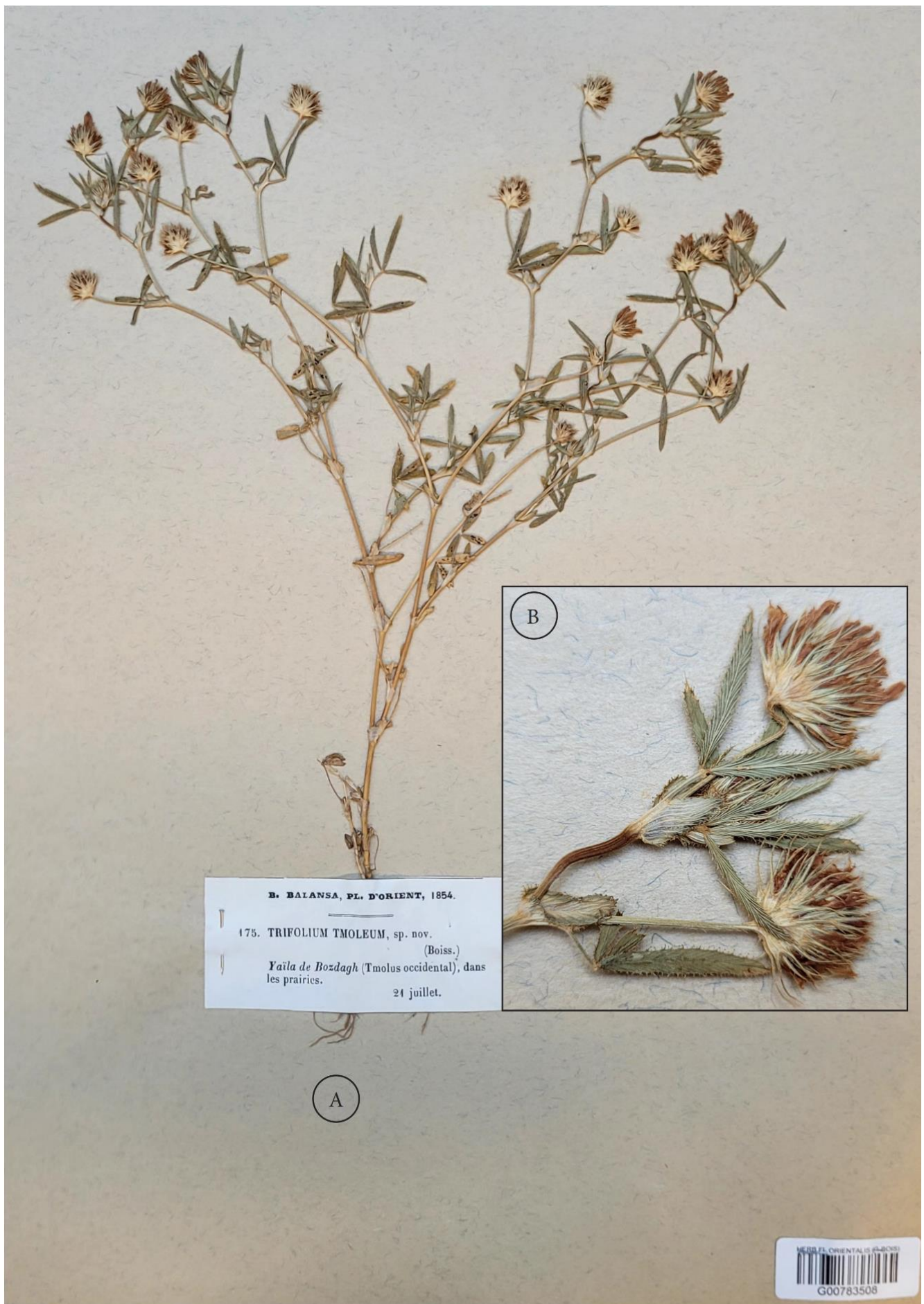
Fig. 4. Trifolium troleum (Boiss.) M. Keskin (A) Lectotype specimen, (B) The close up of inflorescences.