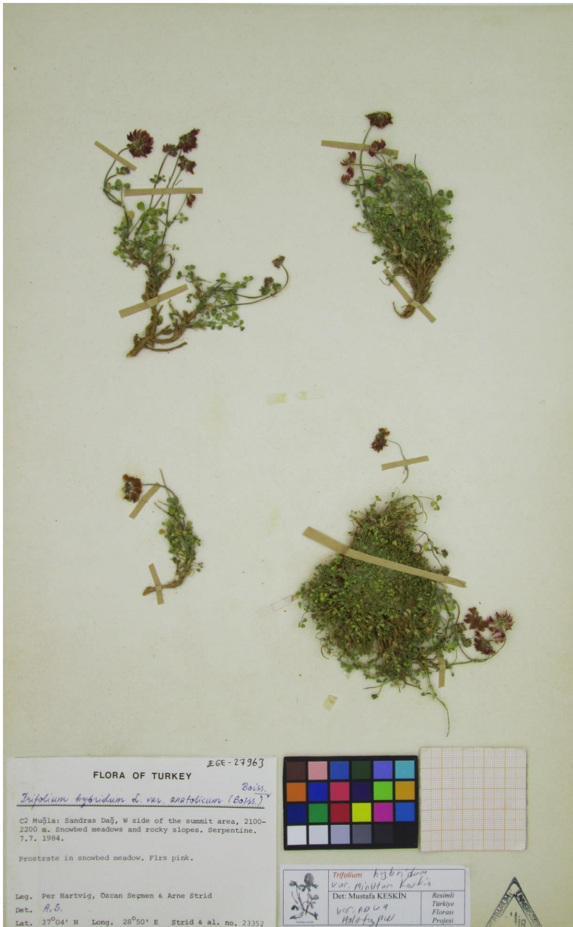
Fig. 5. Holotypus of Trifolium hybridum L. subsp. anatolicum (Boiss.). Hossain var. minutum M.Keskin (EGE 27963).