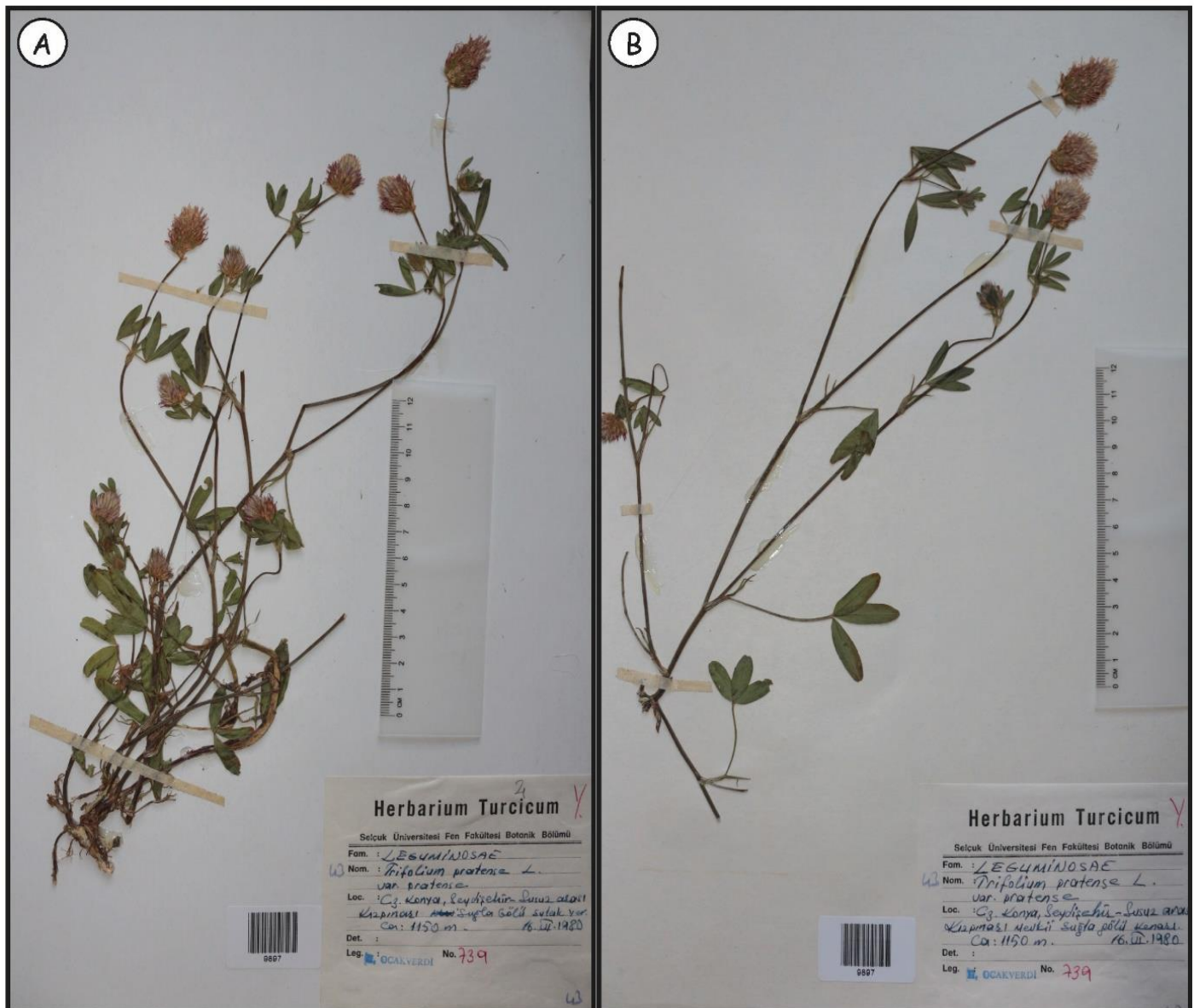
Fig. 2. Trifolium konyaensis M. Keskin: (A) Holotype specimen, (B) Isotype specimen.