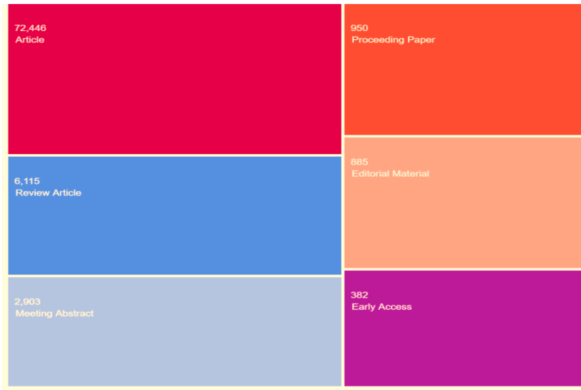
Figure 1. Document type visualization