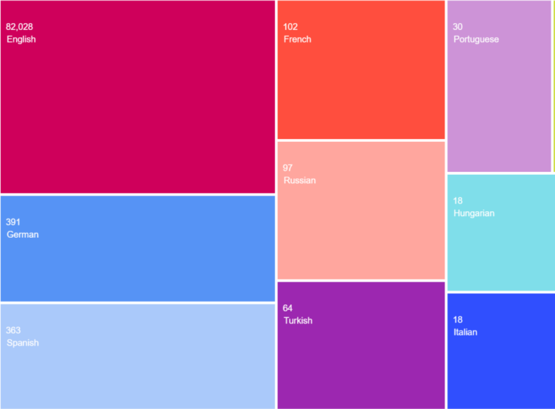
Figure 3. Language visualization