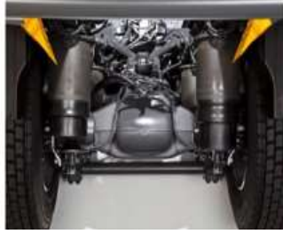
Figure 1. Sample axle types and axle displays in vehicles.

Following the assembly of each axle, one axle is installed on every vehicle. Annually, approximately 28,000 vehicles are produced.