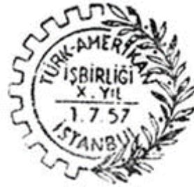
Figure 3. Special envelopes for Turkish-American cooperation and first day stamp ( https://www.pulhane.com/KatalogSayfalari/k195706.html and https://koleksiyonodasi.com/01-temmuz-1957-turk-amerikan-isbirliginin-x-yili/ ).