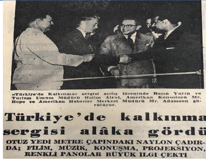
Figure1. (Dünya 15 July 1957: 2)

The exhibition attracted the attention of both the American and Turkish press, and while the focus was on Turkey's development rather than Turkish-American cooperation, the features of the exhibition tent attracted attention. An article published in the Istanbul Ekspres newspaper stated that the phrase "Kalkınan Türkiye" on the tent was no longer a phrase but a reality, and that what had been done and would be done was a great goal and a great gain for every Turk.