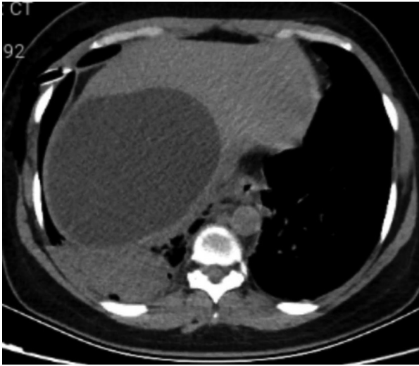
Figure 4. An enucleated hydatid cyst membrane located in the posterior costophrenic sinus and a 17 cm type-1 hydatid cyst in the 7th-8th segment of the liver