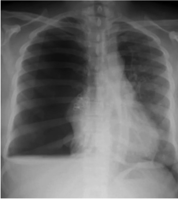
Figure 1. Posterior-Anterior chest X-ray (PA CXR) findings of a total pneumothorax on the right, along with accompanying effusion in the right lung lower zone, suggest a significant pleural process

the tube thoracostomy continued, and a Thorax Computed Tomography (CT) was ordered.