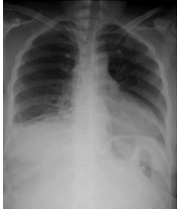
Figure 2. After tube thoracostomy, it's encouraging that the patient's vital signs improved significantly, indicating successful decompression of the pneumothorax and drainage of fluid. Although the control PA CXR shows "expansive" findings

The enucleated cyst membrane was removed, and the thoracic cavity was thoroughly washed with povidone-iodine via thoracotomy. The bronchial openings were sutured and the perforated hydatid cyst cavity was quilted, and partial decortication of the parietal pleura was performed. The patient was then placed in supine position, and the liver hydatid cyst was aspirated lapa-