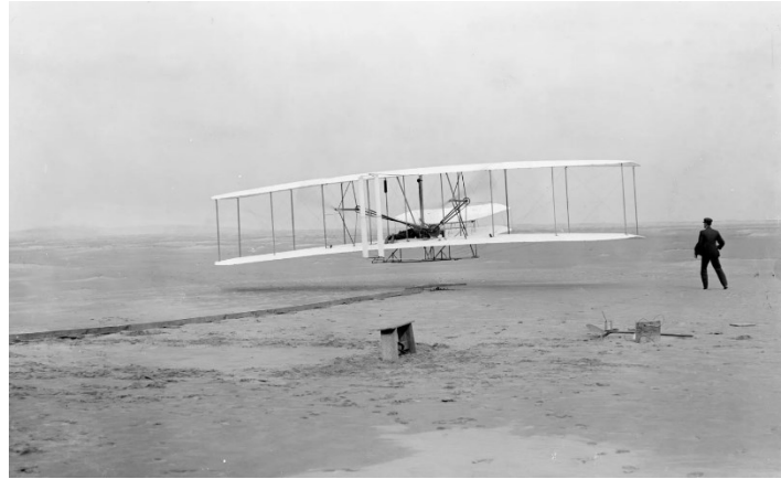
Figure 3. First flight by Orville Wright December 17, 1903 [6]

Since prehistoric times, people have used canoes and rafts as a primitive means of maritime transportation. The first known examples of ships are reed boats built by the Egyptians in 4000 BC (Figure 4). Reed boats, also called papyrus boats, were well-known in ancient Egyptian waters, both on the Nile and the Red Sea. Kuwait is home to the remnants of what is believed to be the oldest reed boat. The ends of the reed boats in Egypt were knotted together, giving them a unique shape. On Ethiopia's Lake Tana, reed boats were (and are) in use [7].