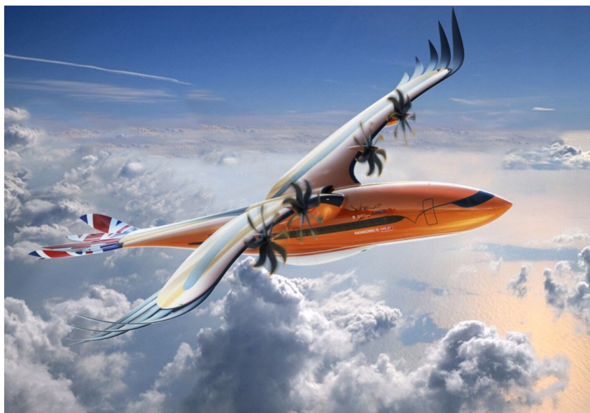
Figure 6. Bird-like passenger plane [12]

The development of the aviation sector in line with the goal of sustainable transportation will be possible with cleaner, greener and quieter air transportation vehicles. This aircraft is built on this principle. The aircraft, which can be used as electric and hybrid, is also known to operate very quietly. With a range of 1500 km, this aircraft is reported to be able to carry 80 people [11].