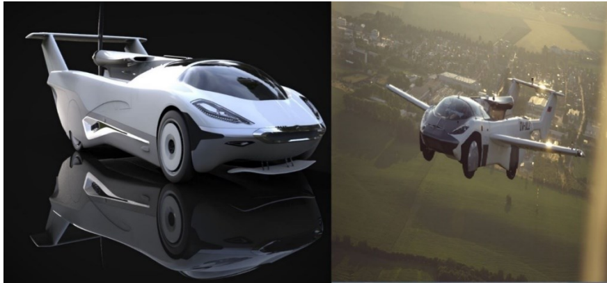
Figure 7. Flying car “Aircar” [13]

minutes. Capable of 190 km/h, this vehicle is expected to reach a speed of 300 km/h and a range of 1000 km after prototype-2 studies. Currently, the type-1 prototype can carry two people, including the driver. The vehicle has a parachute system against engine failure and runs on gasoline [13].