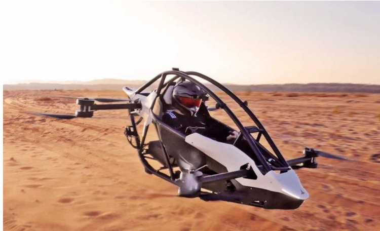
Figure 5. "Jetson One" electric motorized aircraft [10]

Figure 6 below shows the airplane called "The Bird of Prey" by the "Airbus" company. Its most striking feature is its wings that resemble bird wings and its tail design, which is also of the bird tail type.