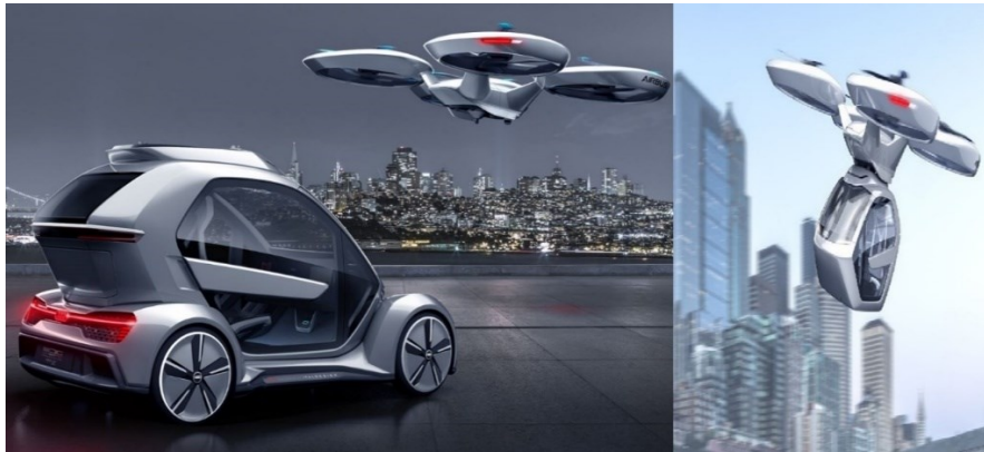
Figure 9. Joint concept of autonomous car and autonomous aircraft [17]

"Pop. Up Next" has an all-electric system. It is a concept vehicle system with zero carbon emissions, designed to reduce traffic congestion in crowded cities. "It was unveiled at the Geneva Motor Show. It can reach 150 km/h and has a range of 50 km in air flight. This range is considered quite sufficient for urban use [17].