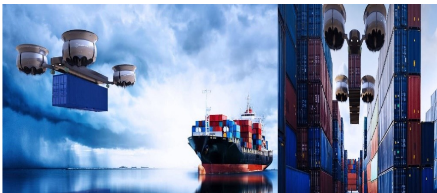
Figure 13. "XC Heavy" unmanned aerial vehicle used for cargo transportation [22]

"XC Heavy", an air freight transport vehicle designed in the USA, is fully autonomous and can take off and land vertically as it is equipped with unmanned aircraft technology. It is designed to transport containers on cargo ships and in ports in a cost-effective and fast way. It can operate as electric and hybrid. Although the maximum amount of cargo it can carry is not specified, it is designed to carry very heavy ship containers. ADF (Adaptive Ducted Fan) technology provides up to 30% energy savings, 35-40% more thrust and noise reduction [22].