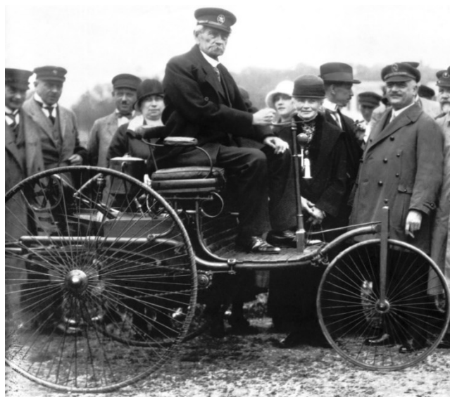
Figure 2. The world's first gasoline-powered automobile invented by Carl Benz [4]

In 1876, Nikolaus August Otto invented the internal combustion engine technology that forms the basis of today's automobiles. In 1886, Carl Benz invented the first gasoline-powered automobile (Figure 2) [1].