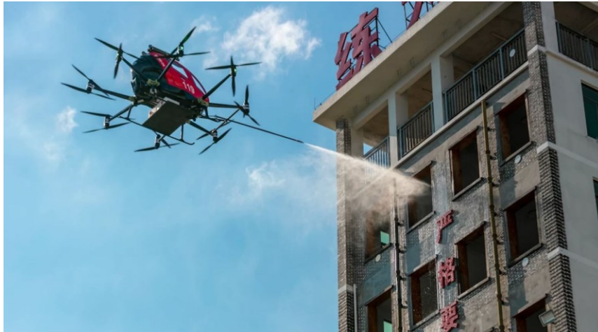
Figure 12. Autonomous firefighting aerial vehicle "EHang 216" [21]

Figure 12, it is used as a fire vehicle by the Chinese fire brigade. It is known that this aircraft, which is the "F" type of EHang 216, can carry up to 150 liters of fire extinguishing foam. In emergency situations, it is essential not to be affected by traffic congestion and not to lose time in responding to fires in the city. Therefore, it is critical to use such fast, non-polluting aircraft that are not affected by traffic congestion in emergency situations [21].