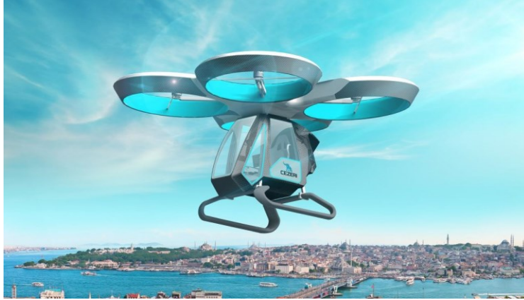
Figure 10. Türkiye's first autonomous flying vehicle [18]

Figure 11 shows the "iFLY", a single passenger autonomous flying taxi designed in the USA. The vehicle, which is fully electric and can take off and land vertically, also has a flight patent in the USA. The vehicle has eight electric motors. Users will be able to call the "iFLY" taxi with the "SKYBorg" application, which can be used on "Android" and "iOS" devices, and will be able to select the desired location and provide transportation. This vehicle has a parachute system just in case. In addition, if the battery level drops below a certain level, the taxi will be able to return to its departure location or land its passenger at a safe landing site [19].