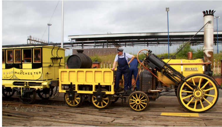
Figure 1. A working replica of the Rocket, a pioneering steam-powered locomotive invented by Stephenson in 1829 [3].

In 1876, Nikolaus August Otto invented the internal combustion engine technology that forms the basis of today's automobiles. In 1886, Carl Benz invented the first gasoline-powered automobile (Figure 2) [1].