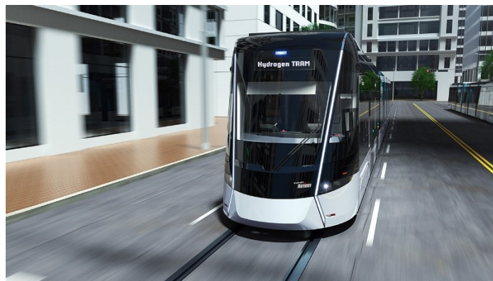
Figure 8. Hyundai Rotem’s hydrogen fuel cell tram [14]

The hydrogen fuel cell tram (Figure 8) being developed by Hyundai Rotem employs a hybrid technology that combines a battery and a hydrogen fuel cell. Using hydrogen from a hydrogen tank, the hydrogen fuel cell generates electricity and stores secondary power in an energy storage system