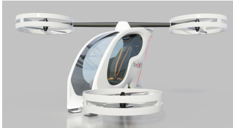
Figure 11. Autonomous Flying Taxi "iFLY" [20]

Figure 11 shows the "iFLY", a single passenger autonomous flying taxi designed in the USA. The vehicle, which is fully electric and can take off and land vertically, also has a flight patent in the USA. The vehicle has eight electric motors. Users will be able to call the "iFLY" taxi with the "SKYBorg" application, which can be used on "Android" and "iOS" devices, and will be able to select the desired location and provide transportation. This vehicle has a parachute system just in case. In addition, if the battery level drops below a certain level, the taxi will be able to return to its departure location or land its passenger at a safe landing site [19].