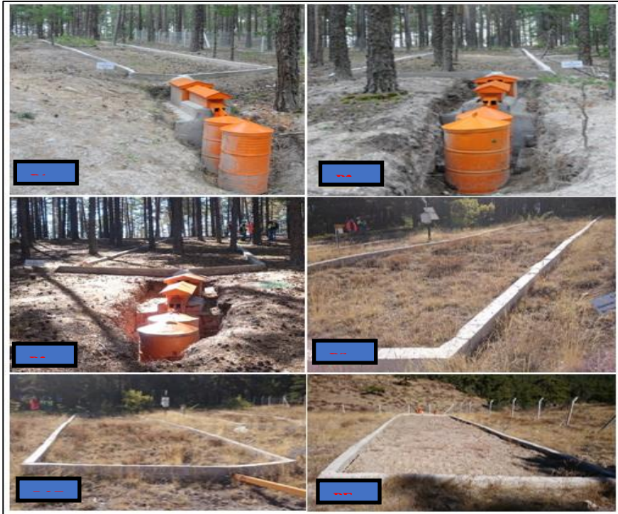
Figure 2. The appearance of trial plots

In addition, the meteorological station was installed to ensure automatic measurement of temperature, air humidity, precipitation and soil moisture values in the trial plots (Fig. 2).