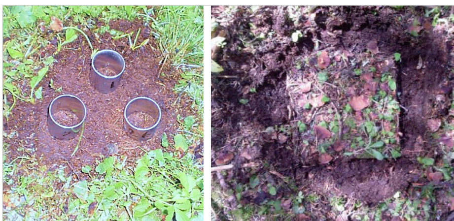
Figure 3. Sampling the soil and litter