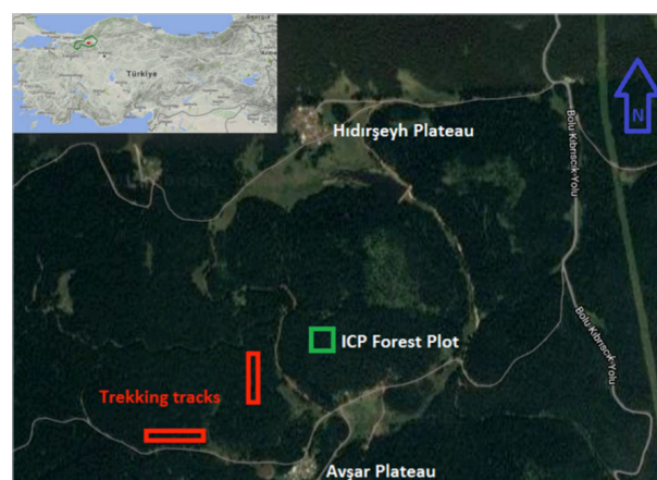
Figure 1. Map of study area (Google maps)

During May 2010, two strips were determined for measurement along the main trekking routes. One of them is Avşar Plateau, the other is "International Co-operative Programme on Assessment and Monitoring of Air Pollution Effects on Forests" (ICP) plot side. The trekking strips were designed to be 100 m long and 1–2.5 m wide under a pure fir canopy and take walkers in single file. The edges of the strips were marked with tape to make it easy to follow the sampling line (Figure 2).