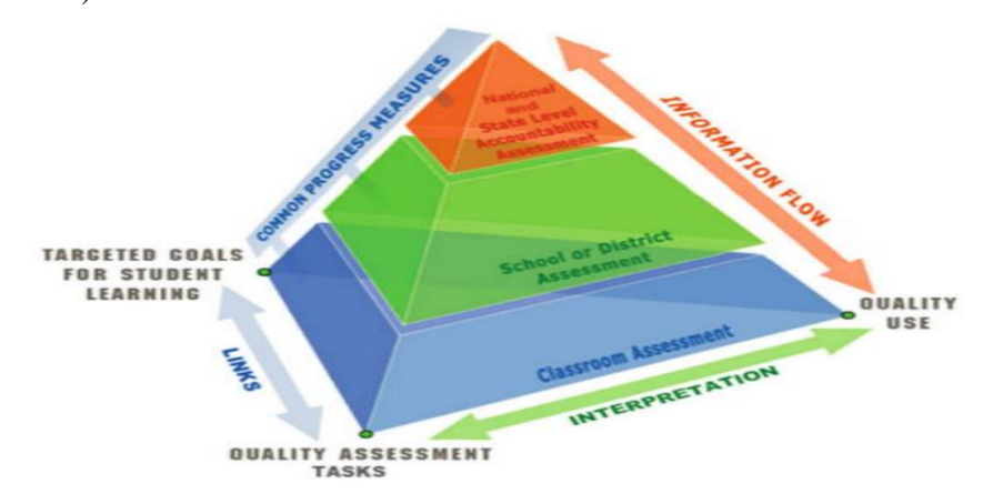
Figure 2 Integrated Assessment System (Binkley et al., 2012)

Figure 2 depicts a system of assessments that utilizes individual student data to offer direct feedback to both students and faculty, while also informing schools and educational systems. This data serves multiple purposes, enabling educators and educational systems to assess program outcomes, enhance curricula, devise improvement strategies, and identify students in need of additional support (Binkley et al., 2012).