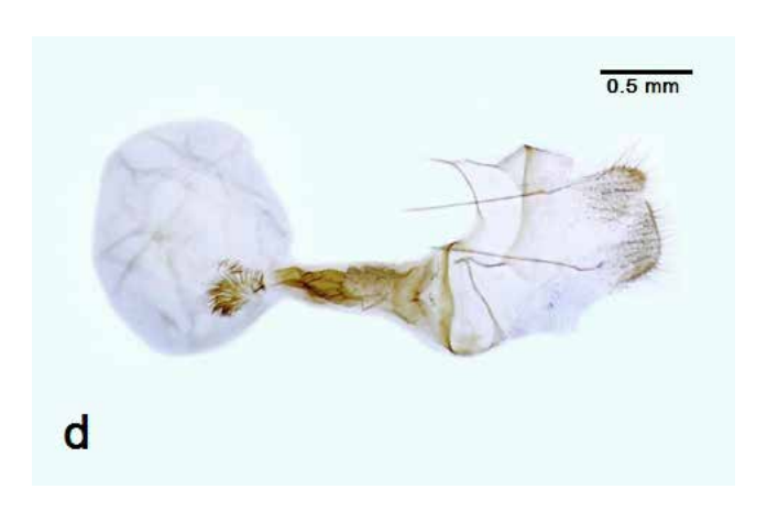
Figure 2. a-b. the adult and c-d. genitalia pictures of male and female of X. inconsiderata (Staudinger, 1892).