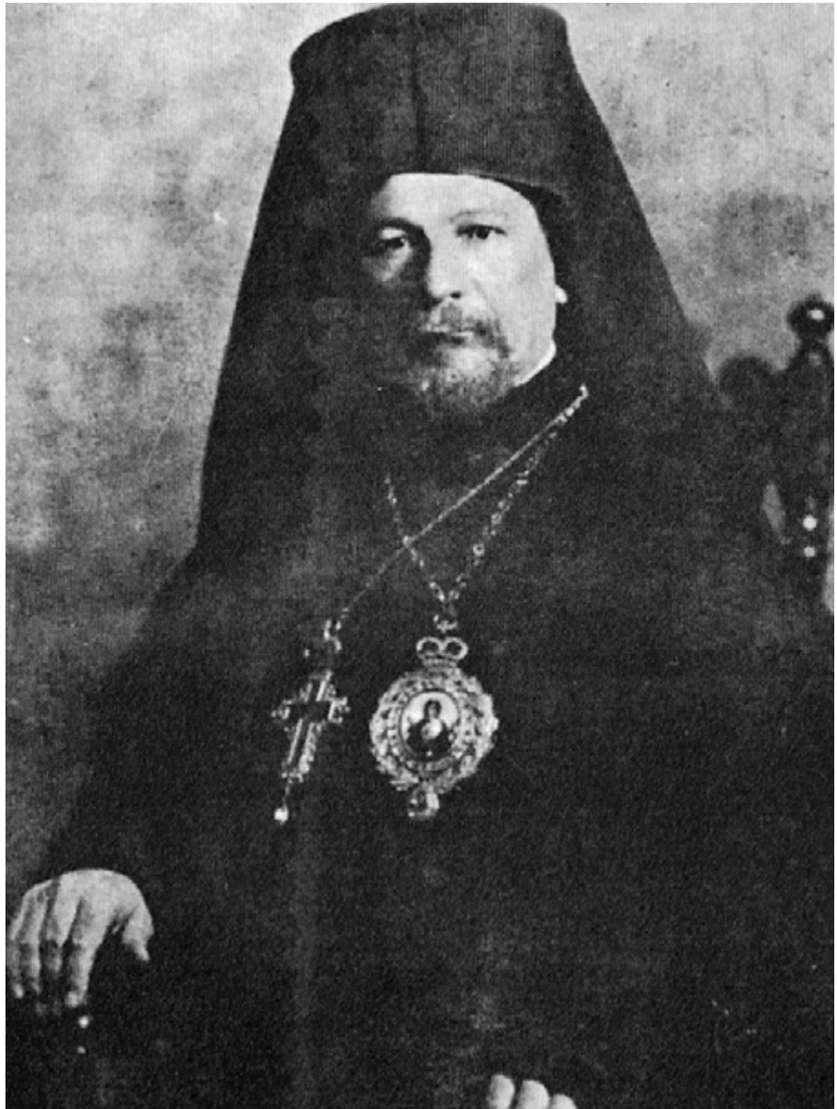
Figure 3: Gennadios Arabacioglou, Metropolitan of Heliopolis and Thira. Αδελφότητα Κωνσταντινουπολιτών Μεγάλου Ρεύματος Βοσπόρου "Ο Ταξιάρχης," accessed December 17, 2024, https://www.megarevma.gr/ .