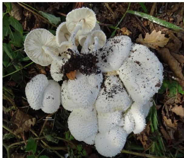
Figure 1. Basidiocarps of Leucocoprinus cepistipes

Microscopic features: Basidia 25-30 × 9-13 µm, clavate, bearing four sterigmata. Cheilocystidia 35-60 × 12-18 µm, clavate to mucronate, with a long, flexuous neck, thin walled, smooth. Pleurocystidia not observed. Spores 8.5-11 × 5.5-6.8 µm, ellipsoid, hyaline, smooth (Figure 2), weakly to strongly dextrinoid; spore print white.