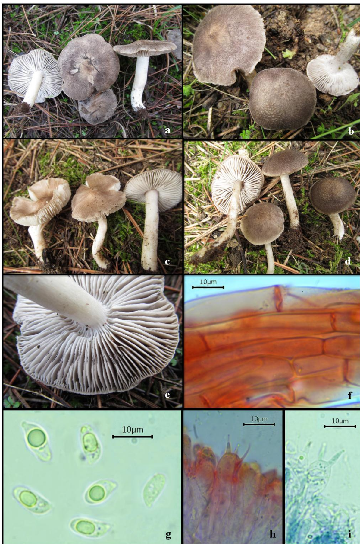
Figure 1. Tricholoma bonii , a-e. basidiocarp, f. pileipellis (in congo red), g. basidiospore (in KOH), h. basidium (in congo red), i. basidium (in creysl blue).