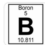
Figure 2. Chemical Symbol of Boron Element (1).

Boron (B) is a dark brown colored element widely found both in the hydrosphere and in the lithosphere. Sea sediments, thermal waters and in some underground waters are rich in boron. In the environment it is mainly found as boric acid and borate salts in the oceans and in seas (12). While boron is an essential metalloid necessary for plant functions is an essential micronutrient for animals and human growth (12, 15, 32).