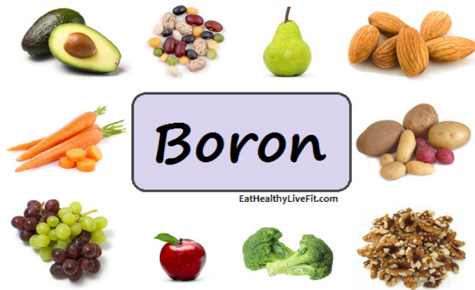
Figure 3. Sources of Boron (27).

The important sources of boron are vegetables, fruits (such as avocado, apricot and raisin), nuts (such as hazelnut, walnut and almond) and legumes (21). It was observed that boron supplementation is an important support in treatment of Lupus Erythematosus, Candida Albicans, parasites, allergies, irregular sex hormones, menopause symptoms, aging, osteoporosis and arthritis (25, 26). Boron supplementation has anti-inflammatory, anticancer, antiviral, antibacterial and antifungal properties (29).