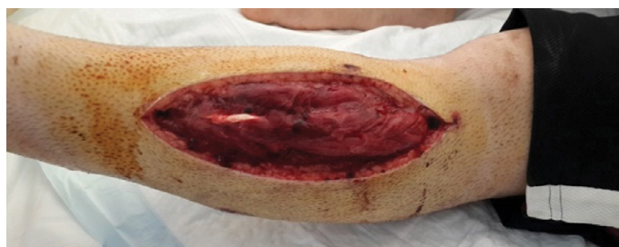
Figure 2. Fasciotomy defect and congested muscle tissue in postoperative day 1.

Lower extremity vascular trauma is a major risk factor for lower leg compartment syndrome. The diagnosis and decision to perform a fasciotomy procedure is still done largely on clinical basis as there is no consensus for threshold intracompartmental pressure. [3] Pressures over 30 mmHg