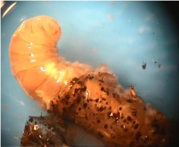
Figure 4 Exit of the last instar of Hyposoter didymator (Thunberg) from Helicoverpa armigera larva which the parasitoid larva after consuming its host

of the pest larvae by changing the feeding habits of the host (the direct effect on the current generation). So, it is important for decreasing the larval damage on the cultural plants (Powell, 1989). Results of another study carried out on Spodoptera littoralis , another host of H. didymator show that non-parasitized larvae consume much more food than parasitized ones (Morales et al. , 2007). The food consumption of the 3 rd instar larvae of S. littoralis that parasitized by H. didymator decreases 4 days after the parasitization and the 6 th instar S. littoralis larvae loses 13% of their weights (Morales et al. , 2007). Results of another study on the same host species suggest that parasitized larvae are advantageous in yield loss since parasitization had a negative effect on the parasitized larvae (Kumar and Ballal, 1992; Kaeslin et al. , 2005).