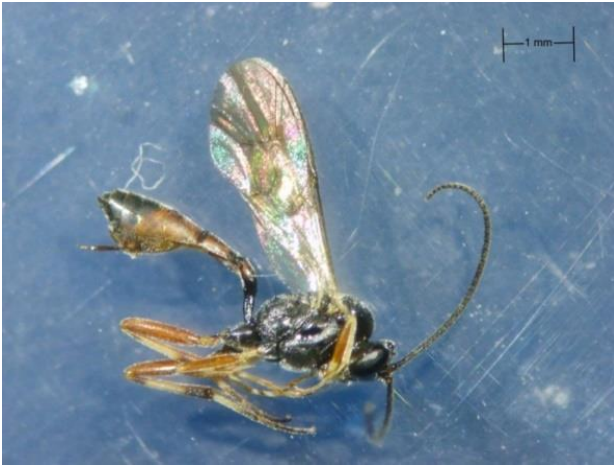
Figure 1 The adult female of Hyposoter didymator (Thunberg)