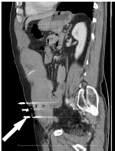
Figure 3: Sagittal CT image shows the extension of RSM to the level below the umbilicus (arrow).