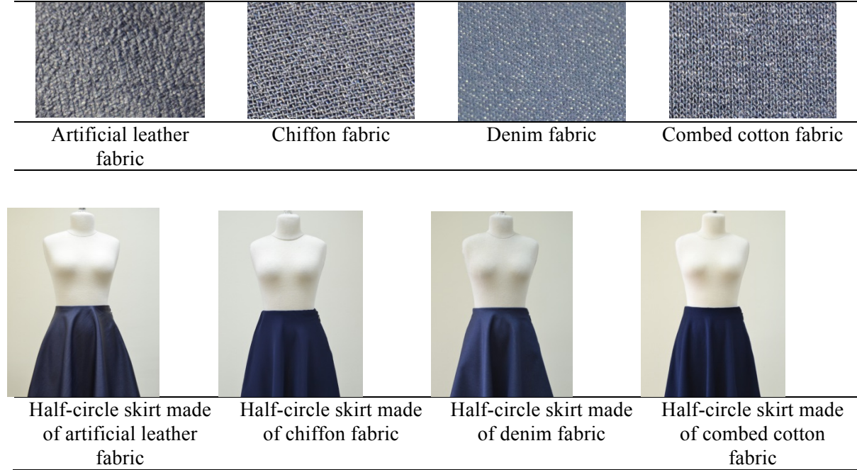
Table 1. Material of the research

The material of the research (Table 1) is “artificial leather, chiffon, denim, and combed cotton” which are four different clothing fabrics. This fabrics was determined according to their structural characteristics “thinness and draping” in terms of their visual and tactile properties. All fabrics are navy blue so that the color factor is not perceptually guiding. Half-circle skirt model was produced from each fabric in accordance with sizes of ½ scale dress form (mannequin). The skirts was dressed in dress forms.