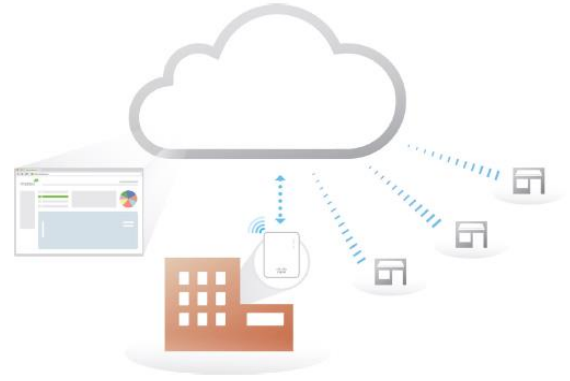
Figure 1. Smart Hotel Project

To answer these types of question a network project has applied to the company shown in the Figure 1. In this project basically three topics are discussed; Guest Insight – Engagement – Actionable Results. These are explained as;