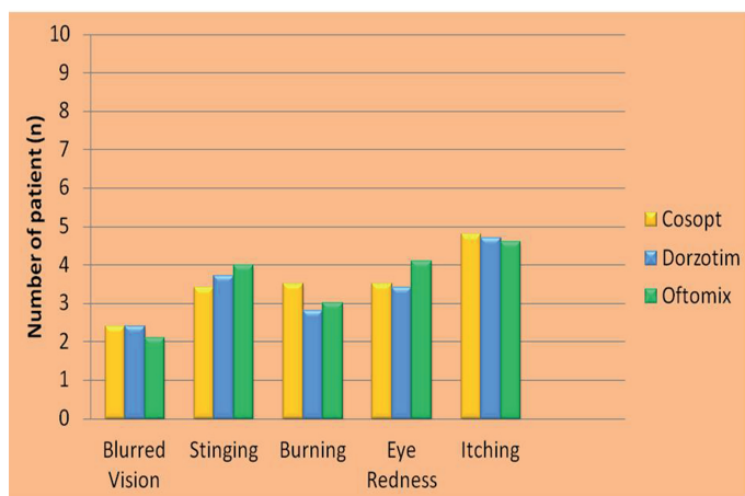
Figure 2: Responses to the Comparison of Ophthalmic Medications for Tolerability (COMTOL) questionnaire among groups.

parameters for all arteries. All retrobulbar velocities increased and resistive index reduced during treatment among all three drops. Even though no statistically difference was found between groups, brand name drug seemed to have a better resistive index lowering effect than two other generic drugs (Figure 1).