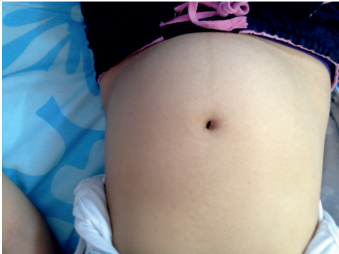
Figure 1. Appearance of abdomen of the patient.

Consequently in adolescent girls to investigate the etiology of anemia is important. We wish to emphasize that the ovarian tumors can be remembered as an etiologic factor of anemia in adolescents.