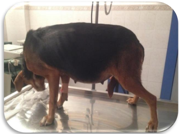
Figure 1. Mild abdominal distention

odorless fluid were detected at inspection of the uterus (Figure 4). The abdomen washed with sterile warm saline and closed with simple continuously absorbable sutures.