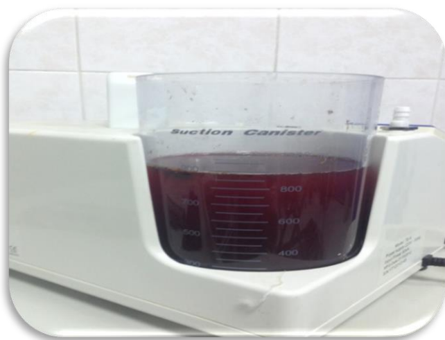
Figure 3. Intraabdominal fluid aspirated at the operation