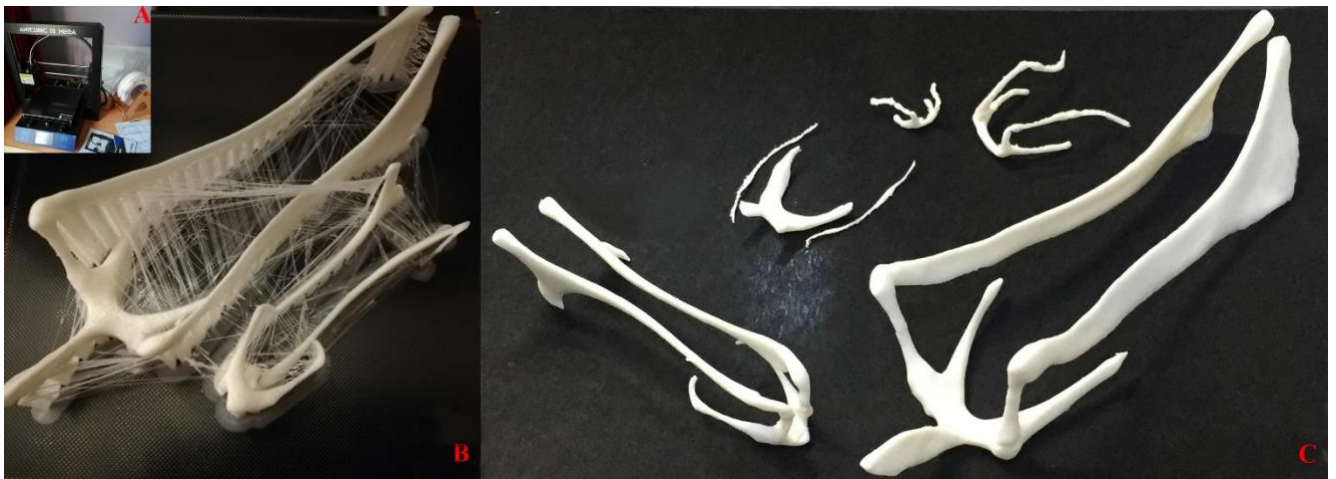
Figure 2: Anycubic I3 Mega 3D printer (A), the printing stage of 3D printing models (B), and 3D printing models of hyoid bones of different species (C).

Şekil 1: At (A-C-E-G) ve köpek (B-D-F-H) dil kemiklerinin 3B baskı modellerinin yapım aşamaları. Orijinal kemik örnekleri (I-J). (A-B) 3D Slicer program ile MD BT görüntülerinin segmentasyon işlemi, (C-D) Üç boyutlu rekonstrüksiyon görüntüleri, (E-F) MeshMixer program ile segmentasyon sonrası düzenleme işlemi, (G-H) Üç boyutlu baskı modeller.