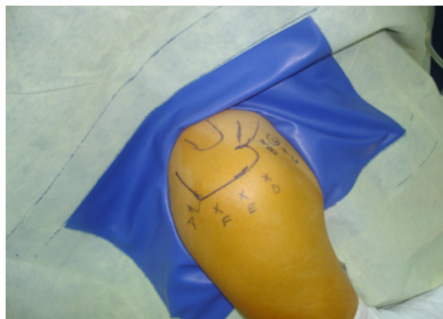
Figure 1. Portals for Shoulder Arthroscopy

All surgeries were performed in beach-chair position, under general anesthesia by placing a supporting neck collar on the patient's neck. Anatomic structures and portals were drawn following sterile dressing (Figure 1).