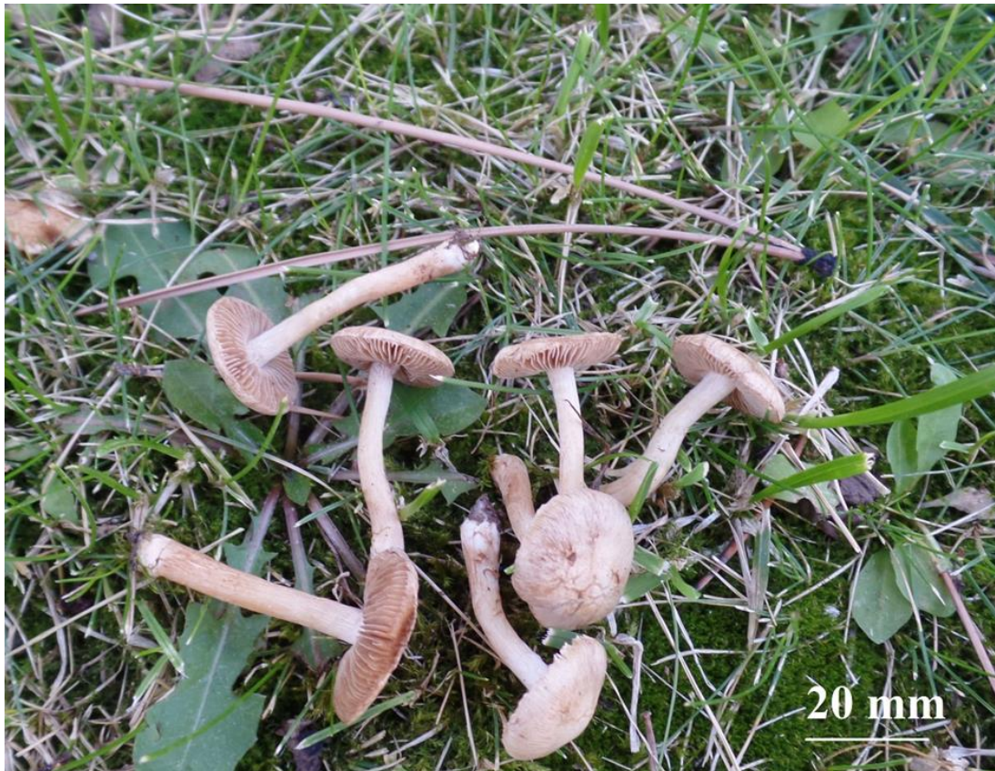
Figure 1. Basidiomata of Inocybe mytiliodora

Through phylogenetic analysis, we revealed two distinct clades of fungal species as well as an outgroup. The major clade (Clade 1) included all Inocybe species together with 'Ank Akata & Altuntaş 167' which was collected from Ankara University Tandoğan Campus (Ankara), while the other clade only included I. tenebrosa . On the other hand, Simocybe sp. was branched far from other fungi species and generated an outgroup as expected with a bootstrap value of 100% (Figure 3). Just as a side note, more firm conclusions will be possible in future studies when more Inocybe species may be included in phylogenetic analyses.