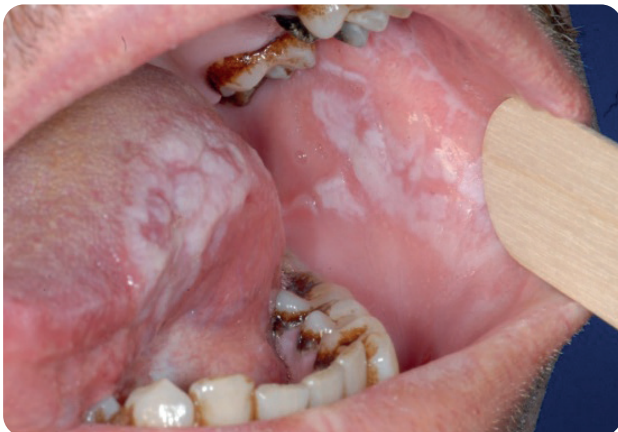
Fig. 3. Granular/nodular leukoplakia