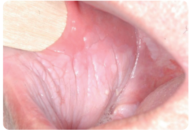
Fig. 2. Thick-fissured leukoplakia