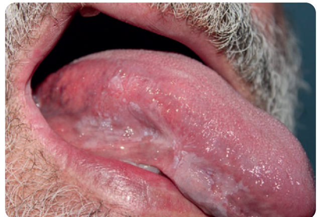
Fig. 4. Erythroleukoplakia