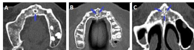
Figure 2. The number of NP canal in axial section. A: One NP canal, B: Two NP canal, C: Three NP canal.