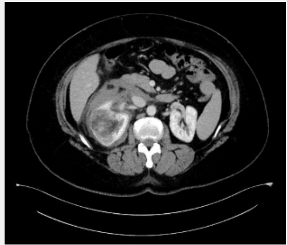
Fig. 2. Computed tomography abdomen scan with contrast.

surgery and right nephrectomy was performed. When her general condition improved, she was discharged with a plan of periodic follow-up.